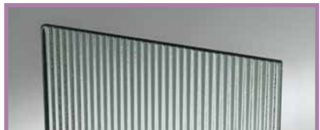
Narrow English Reeded